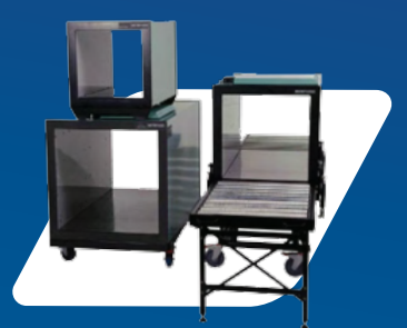
MSTRP-6464, 5050, 4040 Tunnel Reader